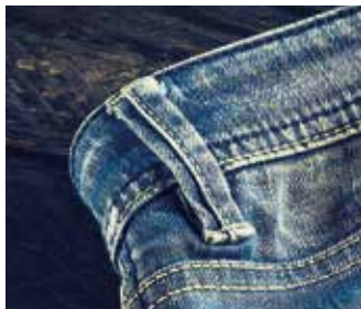
All loop style