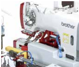
Brother Sewing Head