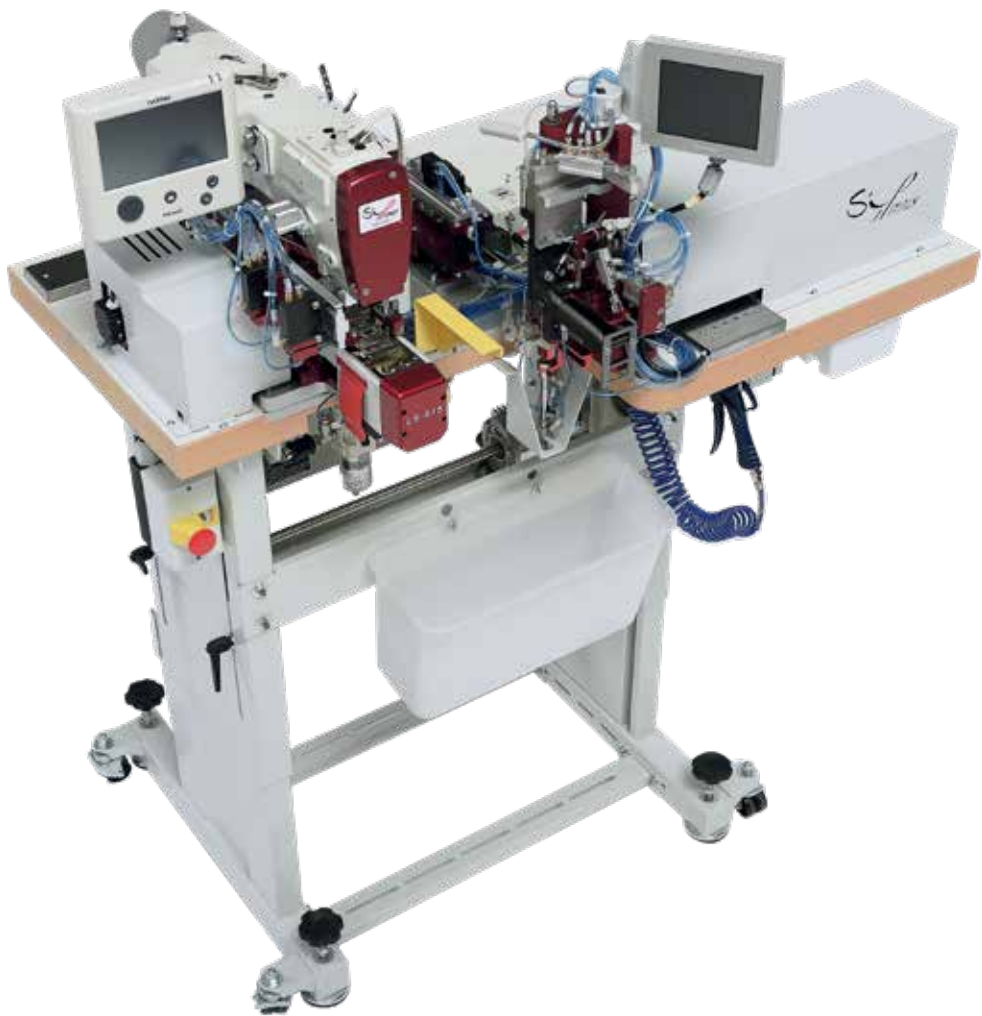
LS915H-SIP Sewing Unit

Automatic programmable belt loop setter unit for cutting, folding and attaching the patch loop in one operation. The user is able to use the unit for all kind of fashion trousers design with variations of sewing program and kind of loop, inserted or patch. The customer does not achieve the R.O.I. only by productivity, the user absolutely needs the flexibility of use for fashion garments, a fast easy change for different garment styles, programming on laptop thus saving production time, having parts available locally. The real worldwide production is fashion and small order run. It means to have more garments coming from different lines to the Belt Loop attaching operation area.